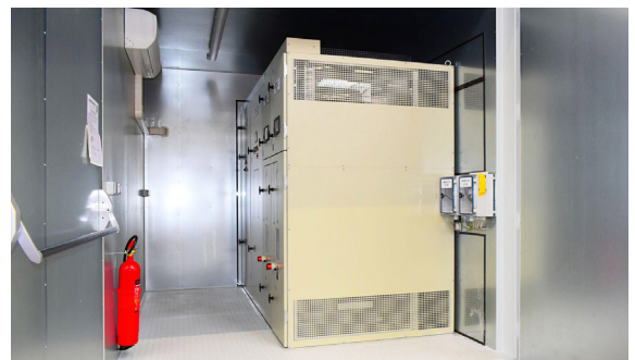
E-House equipped with MBS