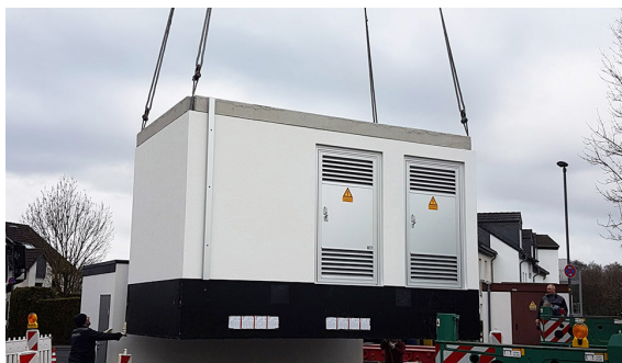
Moving a container